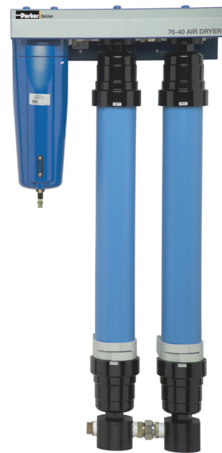
Balston Membrane Air Dryer - Model 76-40

Drying compressed air at point of use is always a challenge in the industries that have hazardous areas, selecting the safest, smallest and most cost effective dryer is critical. Based on cost, size, and safety, membrane air dryers are clearly the best choice.